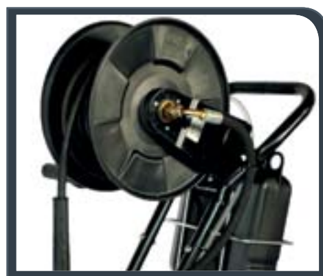
Manico in ferro • Stainless steel handle